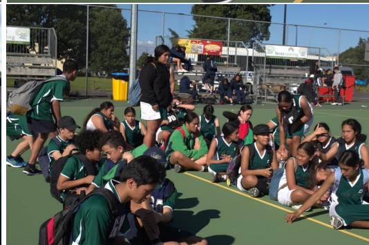
Photos taken at Te Pai courts

Reading Together and ALiM Maths – it was great to see so many parents working with us to support their children's learning. If you get an invitation to attend either of these great partnership opportunities, please take advantage of it. The next round will be in Term 4.